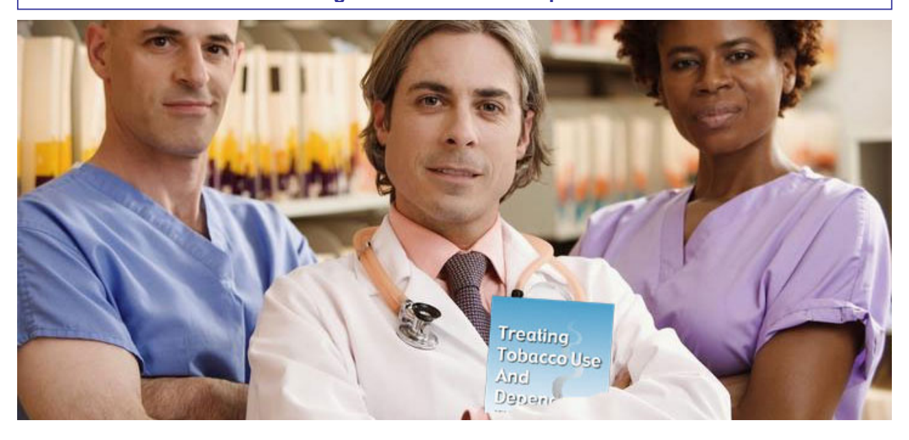
The U.S. Public Health Service has published the 2008 update to the Clinical Practice Guideline: Treating Tobacco Use and Dependence . Recommendations were based on evidence published in more than 8,700 peer-reviewed journal articles. Here's what's new or different from the previous edition published in 2000.